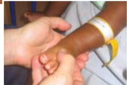
The occupational therapist helps with scar management and to get your child back to normal daily functioning.