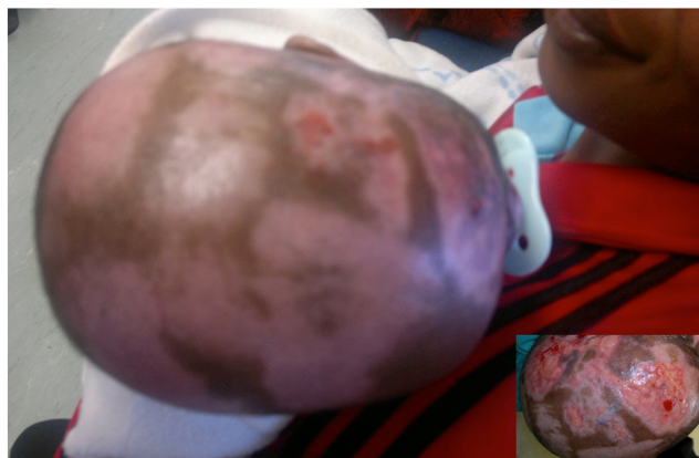
Images taken six days apart show the same wound before (inset) and after application of the new gel treatment.

Phoenix sponsored twenty more vials of gel so that these two patients could also reap the full benefit of the treatment. Both patients are doing exceptionally well and this treatment may well, in their specific cases, save them from the need of further skin grafts.