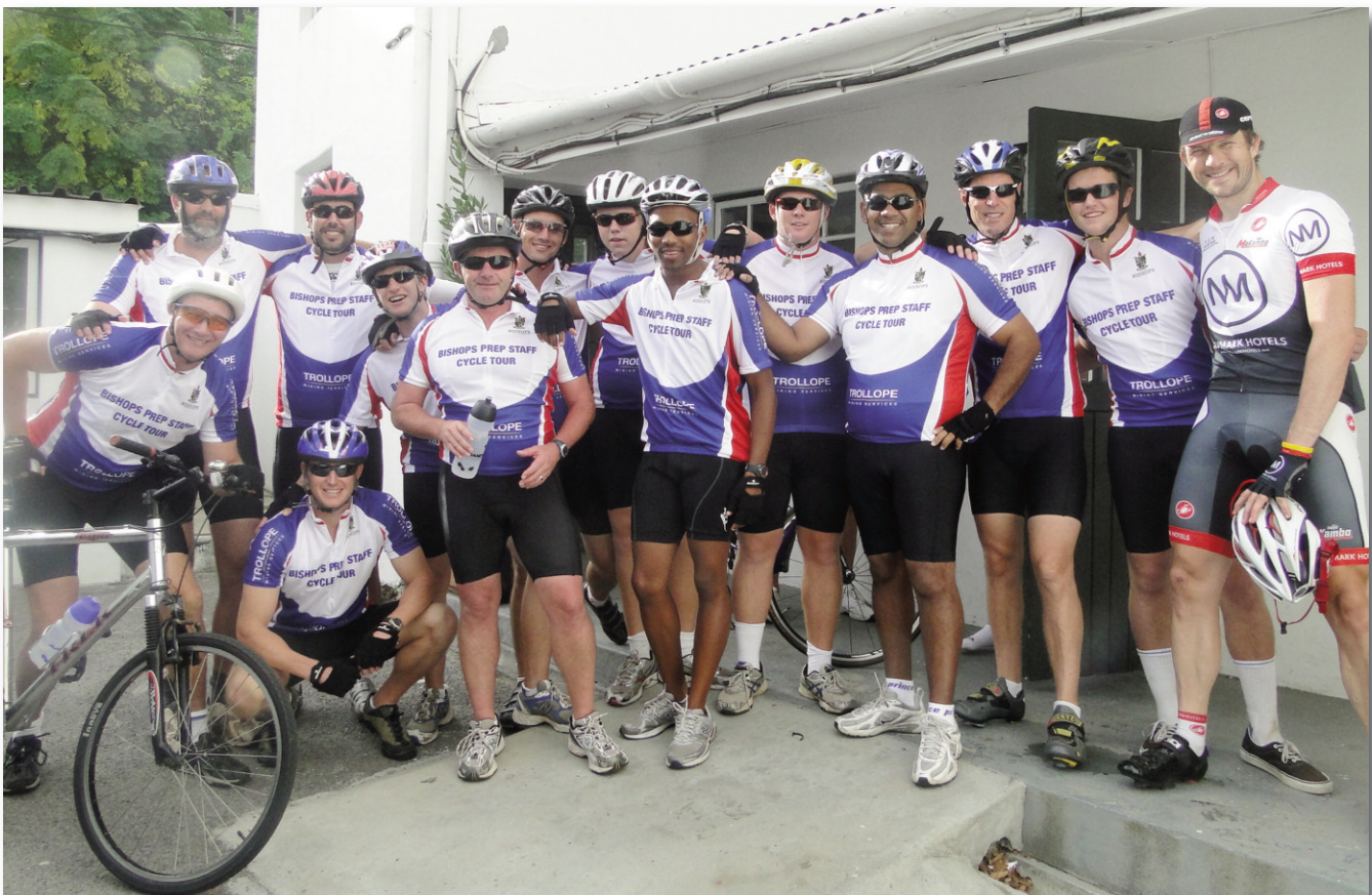
Bishops' champions for burns. Riders kitted up and ready to go on a 300km bicycle tour that raised more than R100 000 for Phoenix.