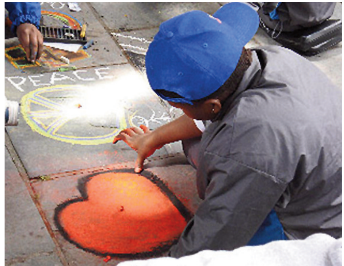
A learner takes part in the annual Chalk4Peace event outside St George's cathedral. Phoenix facilitated the participation of children with burn injuries in the event.