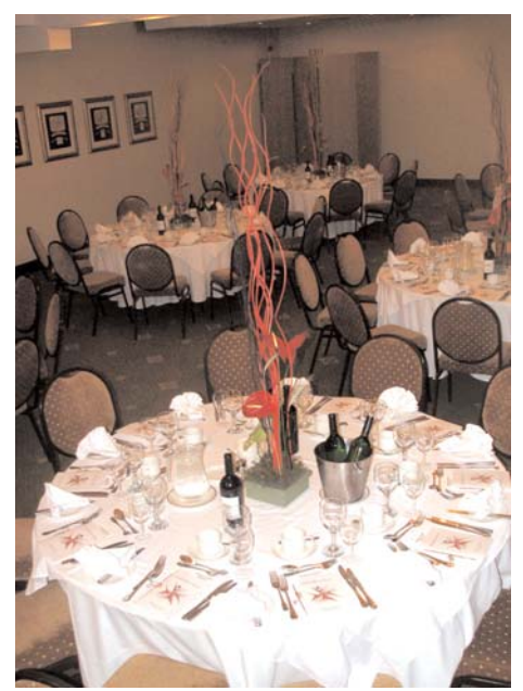
Kelvin Grove is all set to host the Phoenix dinner. The flower arrangement represents the rising Phoenix.