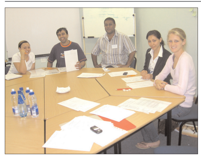
Participants at a one-day training course for doctors on emergency treatment of severe burns.