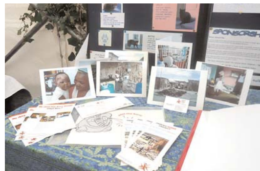
Phoenix display at a Christmas Fair in England.

Phoenix Burns Project, 47 Elms Road, London SW4 9EP Tel: +44 (0) 788 514 2679 Fax: +44 (0) 207 242 0515