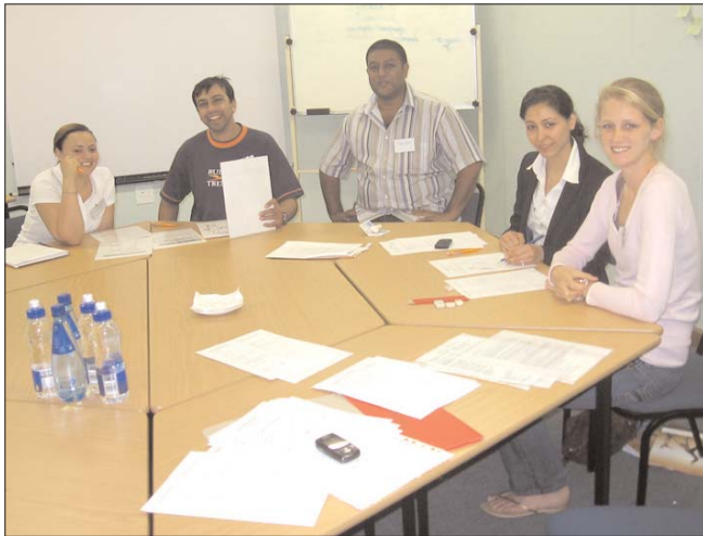
Participants at a one-day training course for doctors on emergency treatment of severe burns.