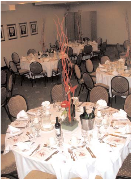
Kelvin Grove is all set to host the Phoenix dinner. The flower arrangement represents the rising Phoenix.